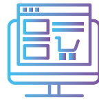
Online Shopping 網上購物