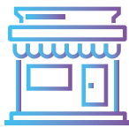
Retail /Physical Store 零售／實體店