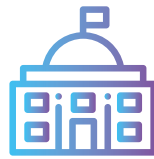
Government Bill 政府帳單