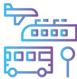
Public Transport 公共交通